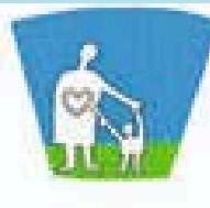
Open Door Foundation