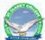
St. Clare's College