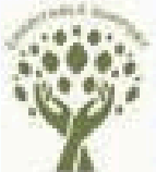
Charitable Support Bangalore