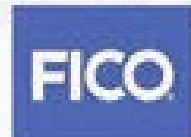
Fair Iskac India Private limited